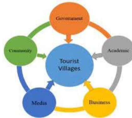
Figure 2. Pentahelix Model in Tourism Village Development